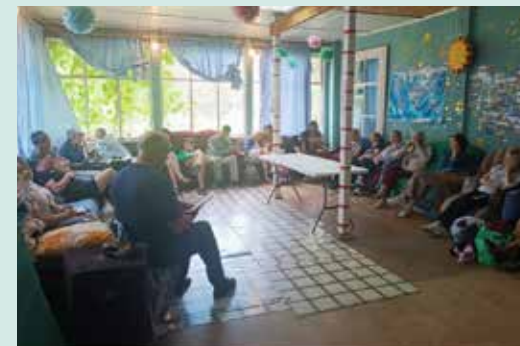
Summer church retreat with children and adults in Russia.

Our compassionate God has always had a heart for the poor. He declares . . . For the poor will never cease to be in the land, therefore I command you, saying, “You shall freely open your hand to your brother, to your needy and poor in your land” (Deuteronomy 15:11). Your faithful support helps the Bible-preaching churches we