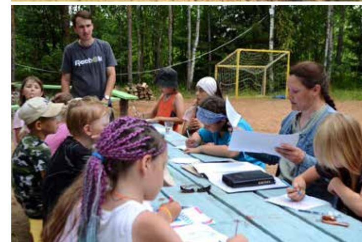
Children at the camp.