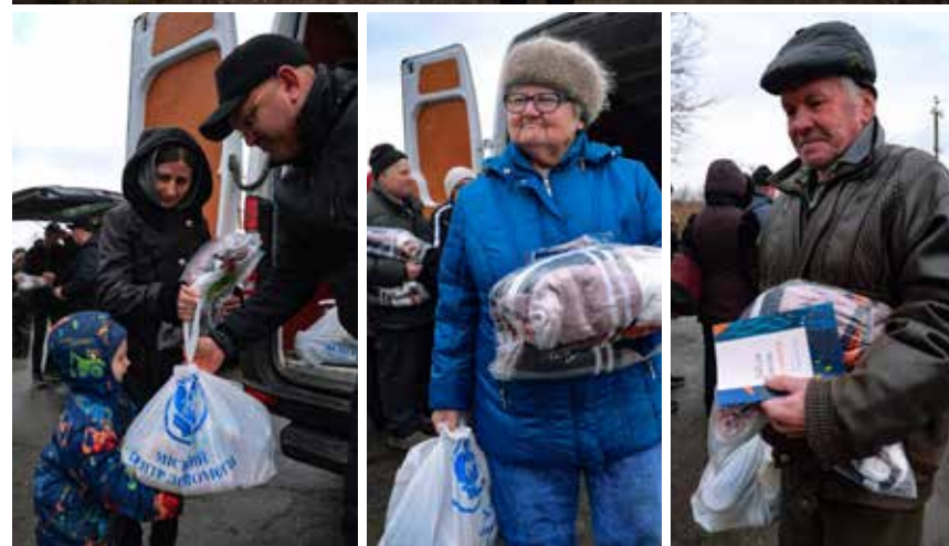
(Top) Sharing the Gospel in Lemeshynske; (Above) Distributing aid.

blankets, first aid kits, and food packages, took spiritual literature, and went to them. It was cloudy and drizzling, but the whole village was already waiting for us on the main street. We greeted each other, talked, and passed on many greetings from our friends and dedicated Christians from SGA. Then, as always, we talked about Christ and His power in salvation. We wept a little about our circumstances, but rejoiced in the hope in Christ. Then, as always, we distributed aid. Thank you for your labor, your help to Ukraine, and your ministry!”