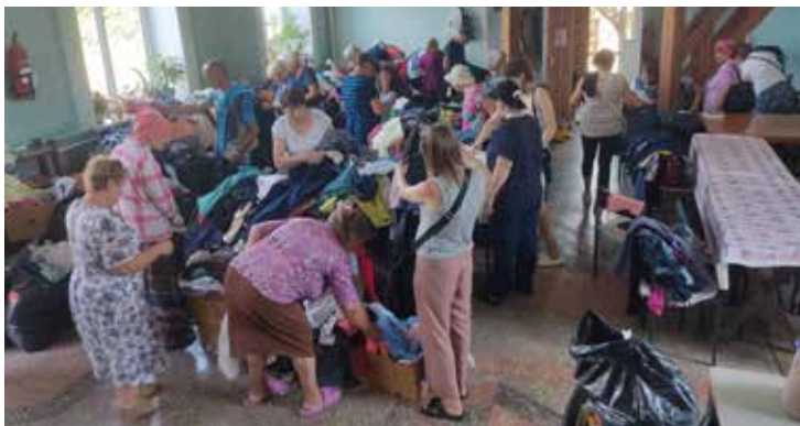
(Top) Lunch for people in need; (Above) Distributing clothing.

Thanks to SGA partners, we received items and were able to distribute them to people. We held services to which we invited displaced persons, the elderly, and to others in need. We held a service and treated them with lunch, then they had the opportunity to choose clothes.