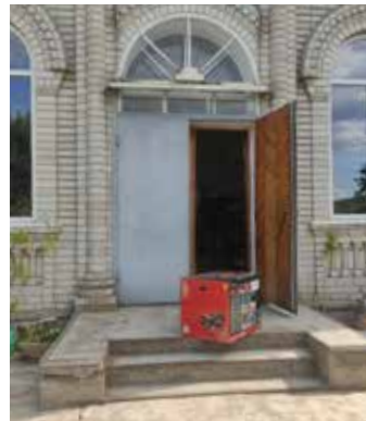
Generator for the church.

Please, continue to pray for us, I send my best regards to everyone and great gratitude for all the material assistance. May God richly bless you! We pray for you! ♦