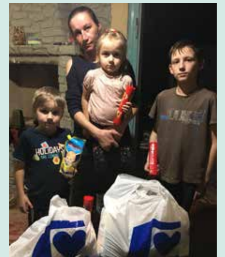
A family in Ukraine receives aid from their local church after the husband/father died in the war.

serve across the former Soviet Union to fulfill this command even as they proclaim the Gospel. Your gifts also provide Bibles and Christian literature, children’s ministries, Bible training, and so much more! Please pray about how you can help today! ♦