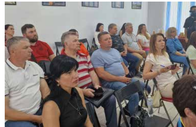
Meeting at the new church plant.

our first steps was to meet local unbelieving youth, who we saw were playing volleyball by the river. We met with them three times a week, played, talked, and shared the Gospel. Each time, on average, about