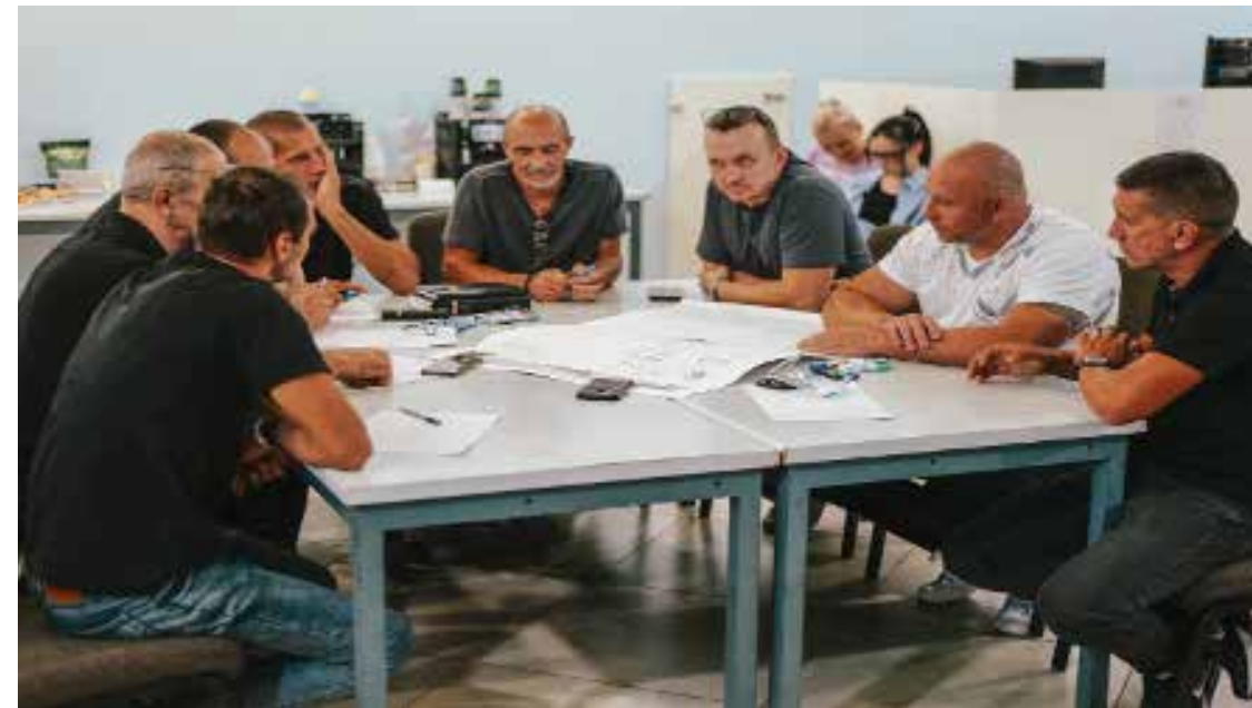
Pastors and their teams meet during the training session.

our first steps was to meet local unbelieving youth, who we saw were playing volleyball by the river. We met with them three times a week, played, talked, and shared the Gospel. Each time, on average, about