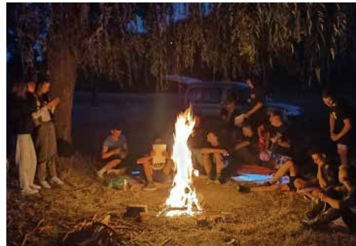
Activities with local, unbelieving youth.