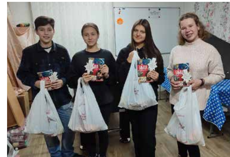
Youth at the outreach.