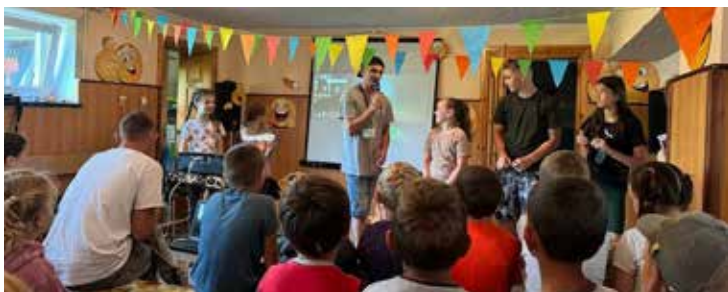
Children listen to a Bible lesson at the day camp.

“Recently, our church hosted a day camp for children on the grounds of our church. Our theme for the camp was ‘Characters that Change the World,’ attended by more than 100 children . In our local villages, we have many children from families who had to flee from the war. Many of them lost their fathers at the war frontlines.