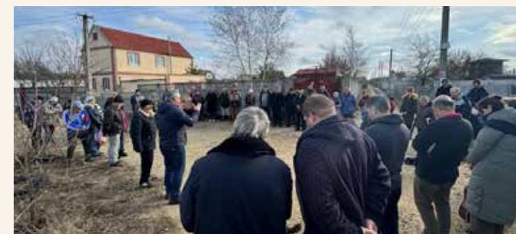
Distributing food aid and sharing the Gospel to a community struggling during the war in Ukraine.

It always brings great joy to see what God is doing through your faithful support of SGA as we serve Bible-preaching churches across Russia and her neighboring nations. Despite ministry