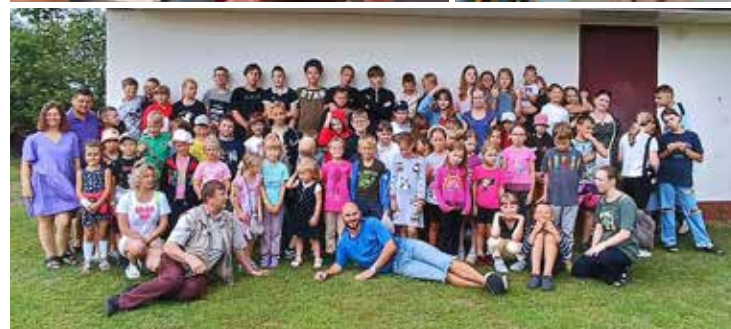
Children at the Vacation Bible School.

In June, we held a Vacation Bible School. The children who attended came from large, low-income, socially disadvantaged families, and there were two orphans. The children proved to be very difficult—there were three kids who were completely out of control. At first, we even wanted to send them home from the camp because of their behavior, but God touched one of these three. Young