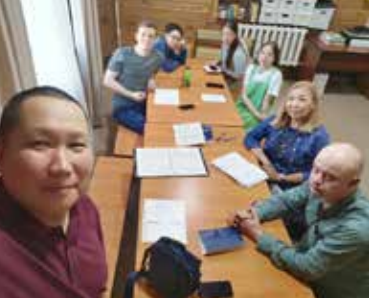
Top L to R: Bible class at church; Preachers School class for young men; Bottom L to R: Christian leadership class for youth and teenaged leaders; Foundations of Faith class.

longed for—learning to navigate the Word of God, learning to understand His will and His action in our lives. I also started a new Preachers School for young brothers who want to learn how to share Scripture with the church through sermons. We have four brothers who attend the classes and they are very motivated for a new ministry.